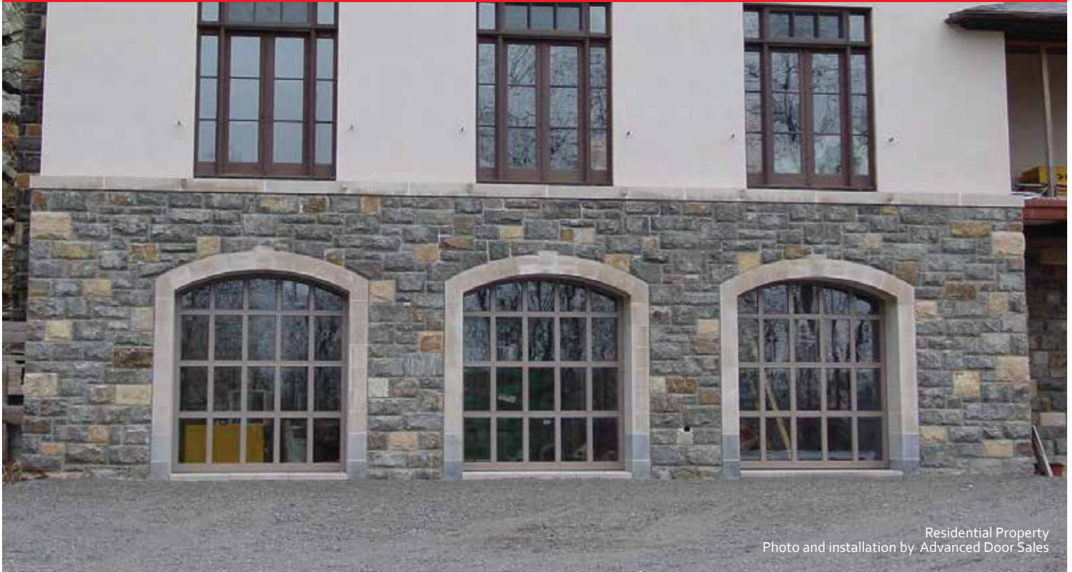
Residential Property Photo and installation by Advanced Door Sales