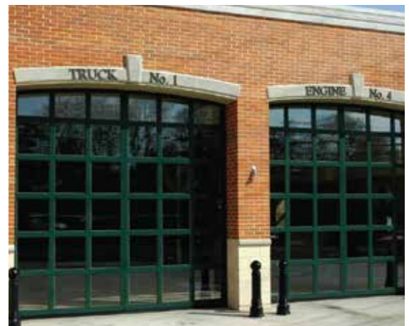
Edison Fire Department, NJ

*Except the top section when trolley operated.