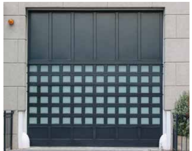
Custom C.I.™ Model with custom panel and section layout, frosted glass and custom color finish. Photo and installation by Advanced Door Sales.

*Except the top section when trolley operated.