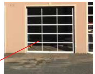
The Electra™ Model features narrow rails and stiles

**3 ⅜" wide per pair for glass thicknesses / weights ¼" or more.