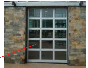
The Titan™ Model features wider rails and stiles