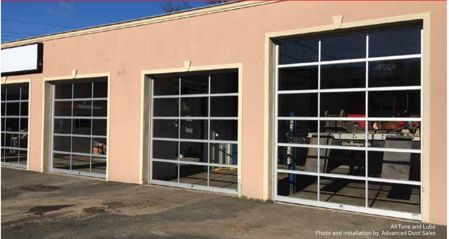
All Tune and Lube Photo and installation by Advanced Door Sales