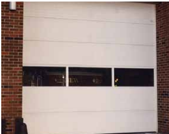
H-16 Model - Newton Fire Department