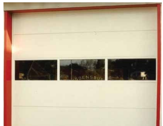
H-16 Model at local fire station