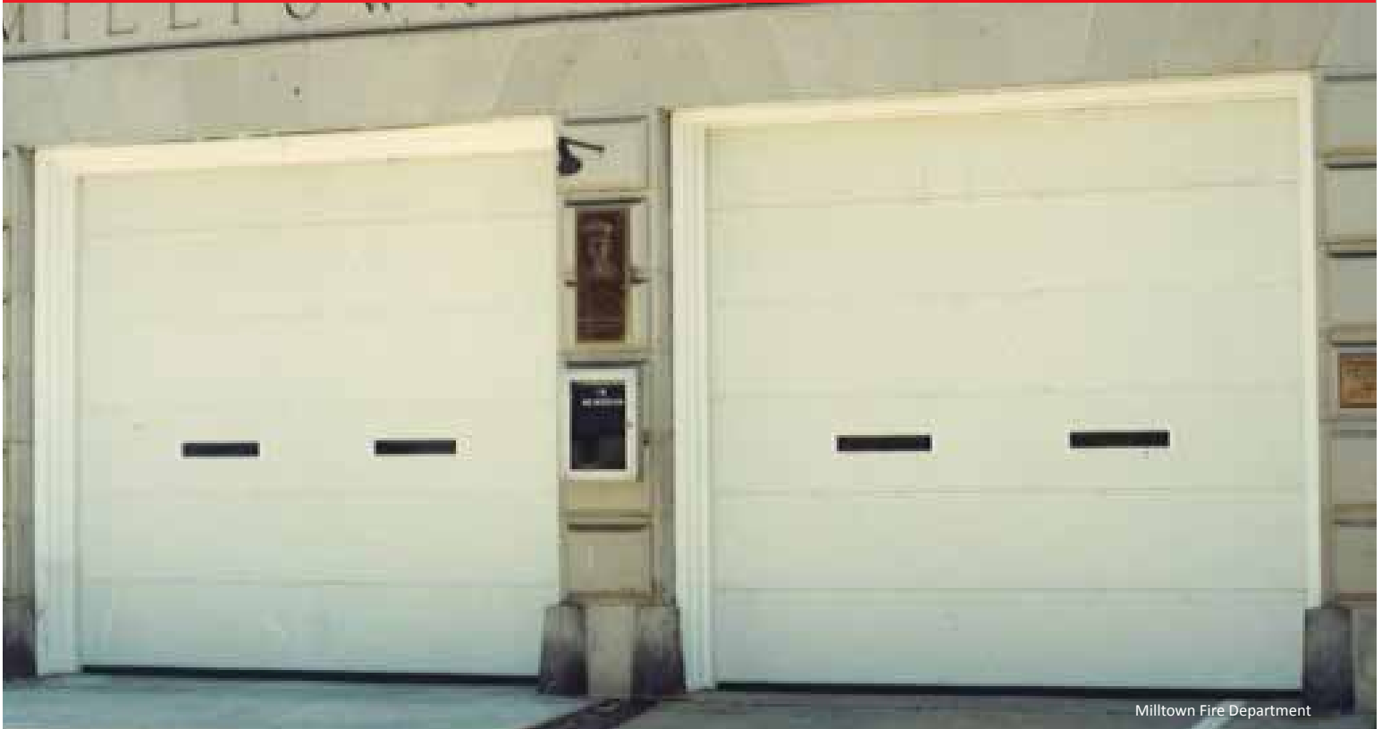
Milltown Fire Department