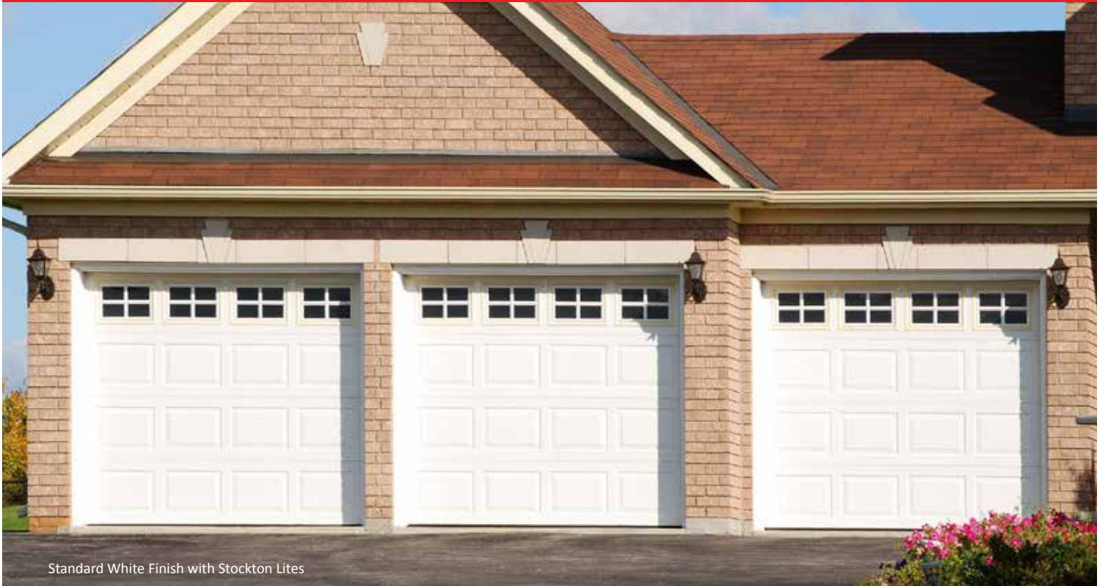
Standard White Finish with Stockton Lites