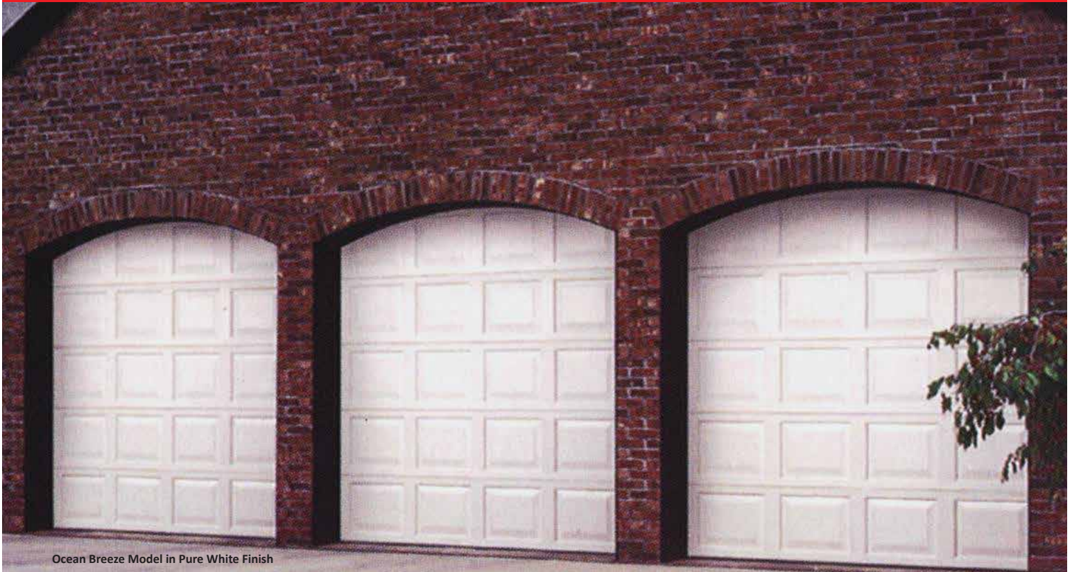
Ocean Breeze Model in Pure White Finish