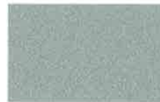
69. Space Silver BK20413XL SRI 58