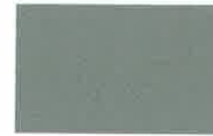
65. Bright Silver* UC55028XLB SRI 51