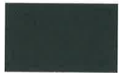
45. Cosmic Gray Mica UC106686F SRI 6