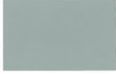
36. Anodic Clear UC110423F SRI 53