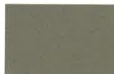
79. Autumnwood Metallic* UC106711LB SRI 41