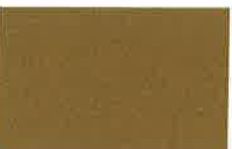
86. Cinnagold Dust UC106717XL SRI 38