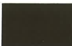
89. Vintage Bronze UC106714XL SRI 2