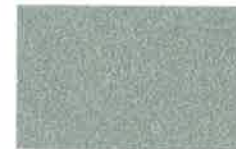
70. Bright Silver II* UC57639XLB SRI 81