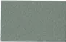
66. Steel-City Silver UC106705XL SRI 48