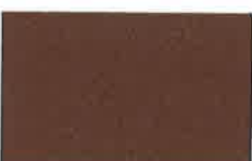
87. Burlesque UC106719XL SRI 20