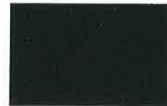
75. Graphite Gray* UC106708LB SRI 2