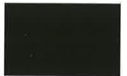
60. Café Noir Pearl UC106695F SRI 23

The Duranar color chips provided in our color guide are as close as possible to the Duranar paint color, however color chip reproduction has limitations. Panels of the actual Duranar finish are available upon request. The color guide represents the range of available colors, and custom color matches are available within the limits of durable color pigments.