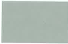
62. Platinum UC106704XL SRI 53