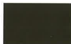
90. Dark Bronze UC51602XL SRI 6