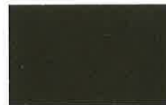
85. Chocolate Bronze UC106709XL SRI 6