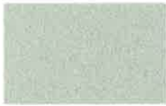
48. Sunlight Silver UC106681F SRI 76