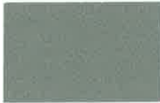
67. Champagne Metallic UC70178XL SRI 51