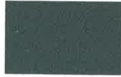
44. Gray Velvet UC70214F SRI 15