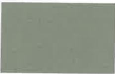
77. Champagne Gold UC51568XL SRI 31