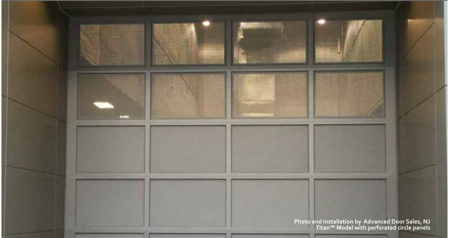
Photo and installation by Advanced Door Sales, NJ Titan™ Model with perforated circle panels